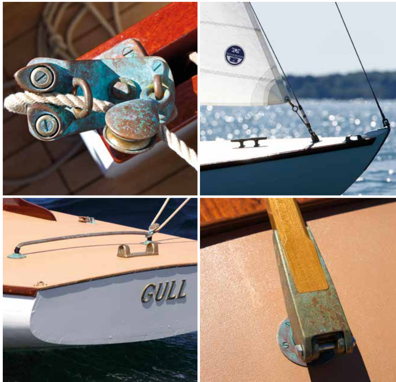
Clockwise from top left: Herreshoff fittings left unpainted; fitted with North racing sails; original tiller kept on; the name 'Gull' isn't painted on; instead the bronze lettering stands out proud

V enetian Harbour does not sound like the name of a place that should exist next to America's bustling submarine base in Groton, Connecticut. But a five-minute boat ride around the corner from the cavernous dry docks, steel girders and massive naval ships finds a narrow strip of protected water only a few hundred metres long surrounded by shingled summer homes and a diminutive police station where the officers wave to everyone.