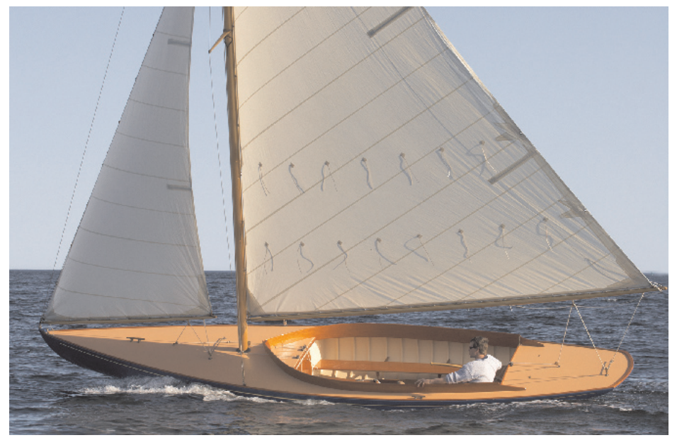
Kitty; photo by Jamie Bloomquist. For additional photos please visit http://www.jamiebloomquist.com/ArtisanWatchHill/

Next, we built a Herreshoff Watch Hill 15 for a family on Nantucket Island. At the customer's request, we redesigned the cockpit to make it more comfortable and eliminated the running back stays to make her self-tacking. Kitty , made apperances at Portland's Maine Boatbuilders Show in March, the Newport Boat Show in September, and was featured in the Summer Boat Show issue of Maine Boats, Homes, & Harbors magazine.