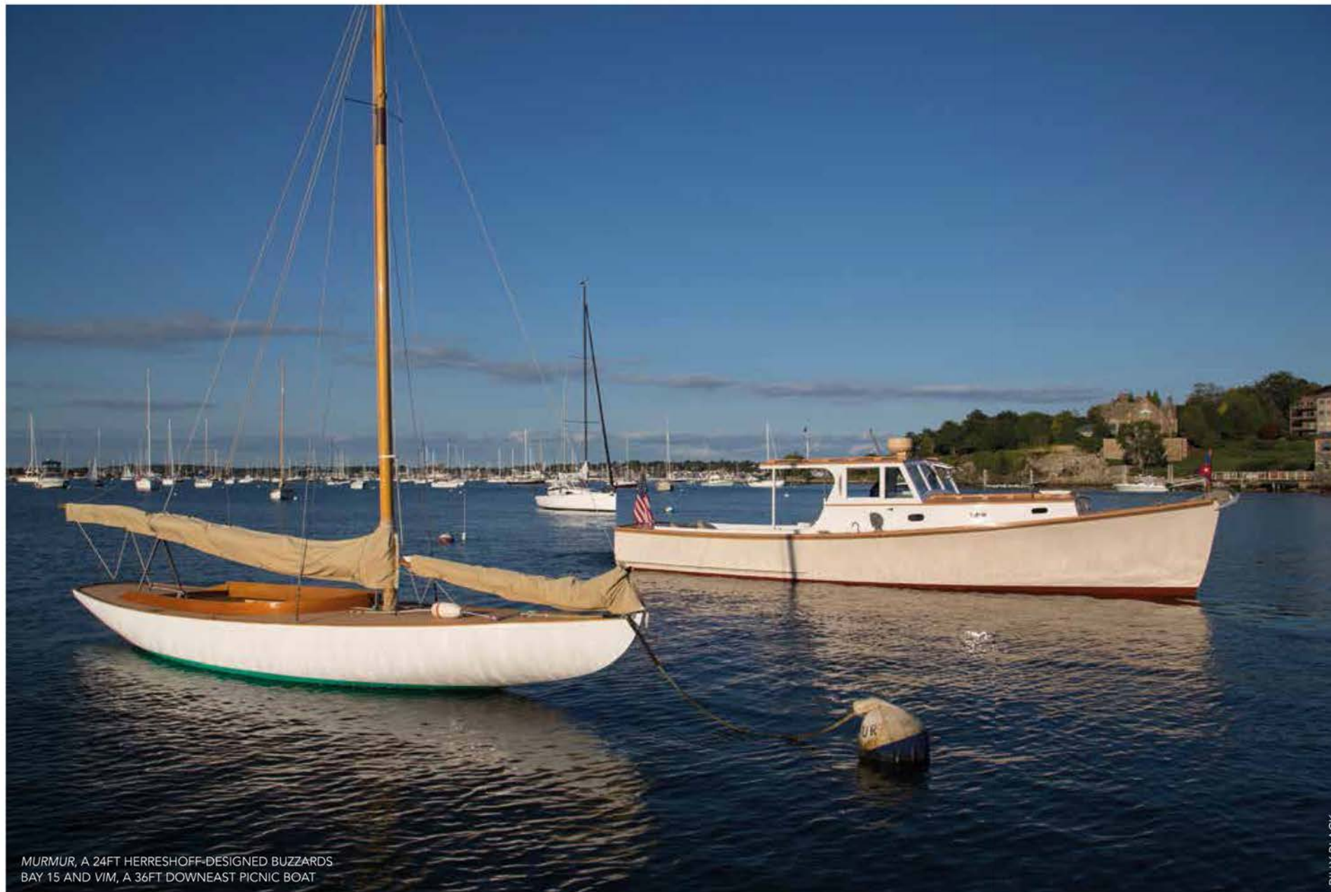
MURMUR, A 24FT HERRESHOFF-DESIGNED BUZZARDS BAY 15 AND VIM, A 36FT DOWNEAST PICNIC BOAT